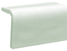
A8242 Sink Cap