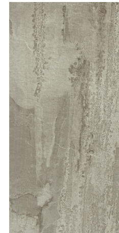
12 X 24