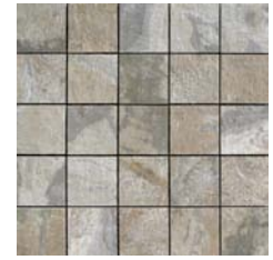
2 X 2 MOSAIC