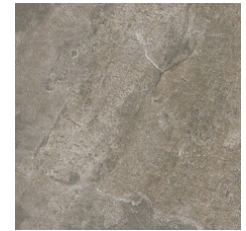
12 X 12