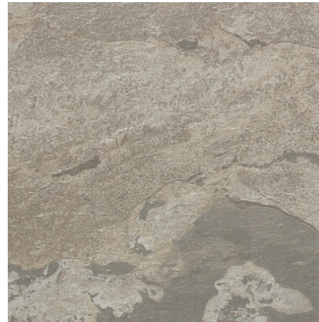
24 X 24